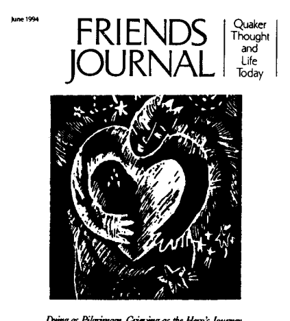
Dying as Pilgrimage, Grieving as the Hero's Journey Accepting the Unacceptable Godspeak: A Philosophical Reflection on the Inner Light