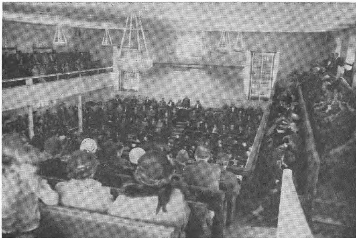
FIRST SESSION OF THE REUNITED PHILADELPHIA YEARLY MEETING, 1955

The discussion brought to light ways in which other Meetings answer this need for closer fellowship. The deep question was raised: Is it true that we have members who do not feel that