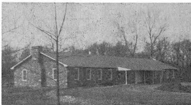
NEW MEETING HOUSE AT YARDLEY, PA.