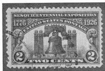
Issue of 1926