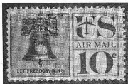
Issue of 1961