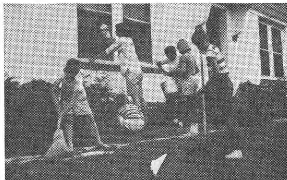
Shown above are members of Southampton, Pa., Meeting working on their new First-day School building, the purchase of which was made possible in part by a loan of $2,000 and a grant of $2,700 from the Meeting House Fund.

The loan to Ann Arbor Meeting is being refinanced through New York Monthly Meeting.