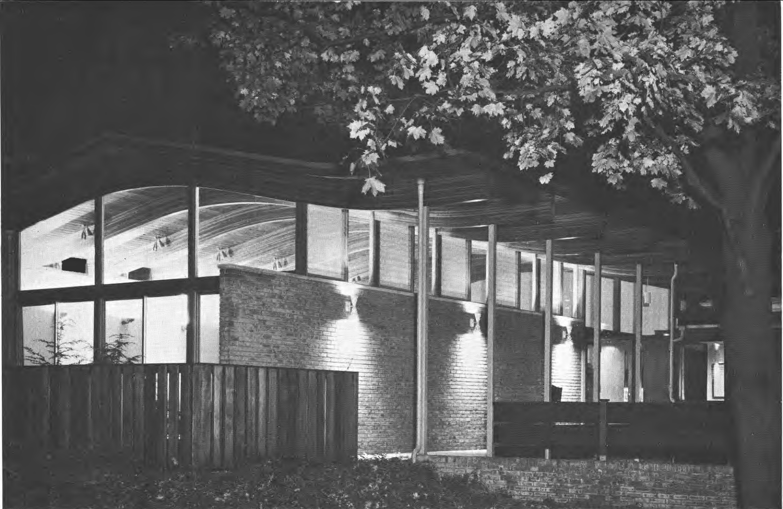
The new Ann Arbor, Michigan, Meeting House, completed in 1962 with aid from the Meeting House Fund of Friends General Conference