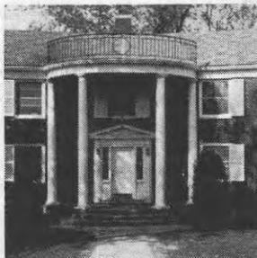
ENTRANCE TO CRAIG HALL DORMITORY FOR GIRLS