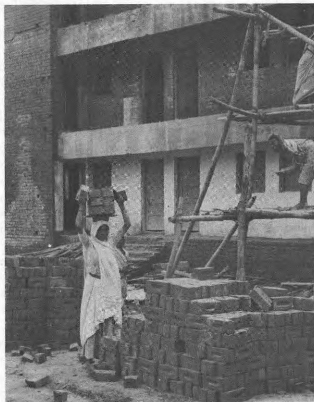
Constructing new housing in Baroda

Interest in the project is keen, especially in educational, social-work, and government circles. This is not an unmixed blessing. The publicity we have received and the premature "inauguration" of the project in March focused attention on the project and may have led people to expect too much too soon. We are frequently asked when the work in the neighborhoods is to begin, and we continue to explain all the steps that must be taken first.