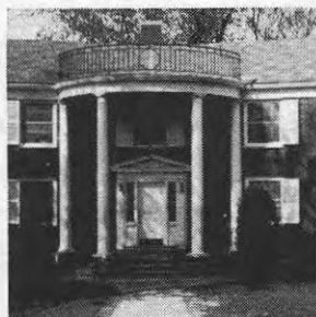
ENTRANCE TO CRAIG HALL DORMITORY FOR GIRLS