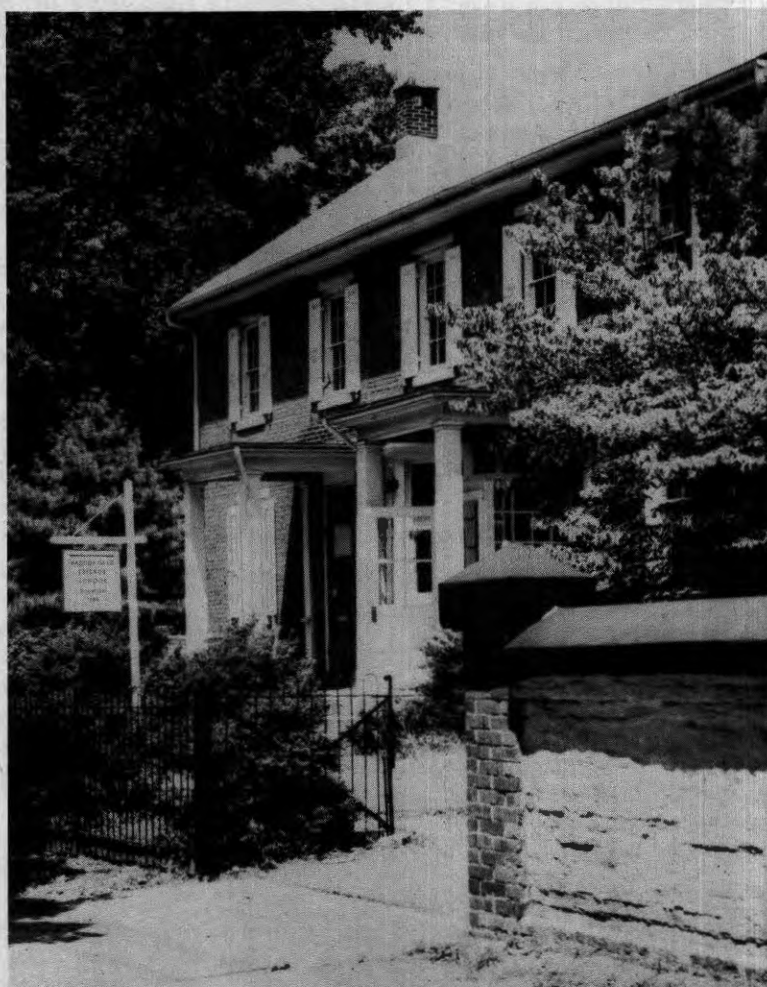
Haddonfield Friends School (Photo by Carl Reed. See page 125.)