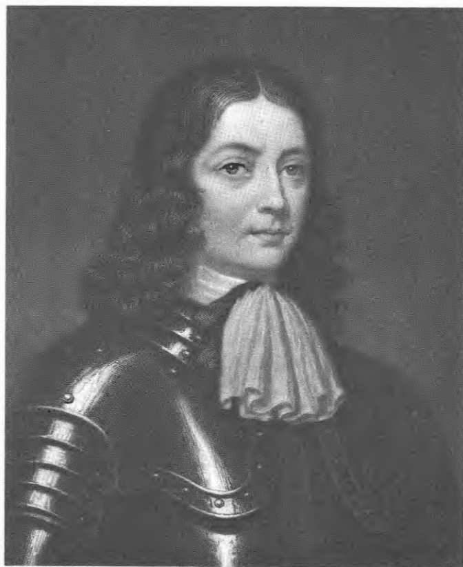
One of many versions of the famous "Penn in Armour" portrait—of doubtful authenticity but presumed to have been posed for by William Penn around the time of his friendship with Samuel Pepys ( see page 198 ).

H ISTORIC Quakerism is like a rich mine in which valuable building material is stored, and from it we may dig out the hidden treasure and fashion and rebuild it to meet the needs of our own time. We have often been prone to think that the light which illuminated Fox and Penn and Barclay is more important than the light which shines for us today. Fortunately, we are experiencing a revival of the kind of motive power which has made them worthy to be remembered. The progress which we make in putting into practical operation these essentials to Quaker living will measure our ability to meet our share of reconstructing a sick world.