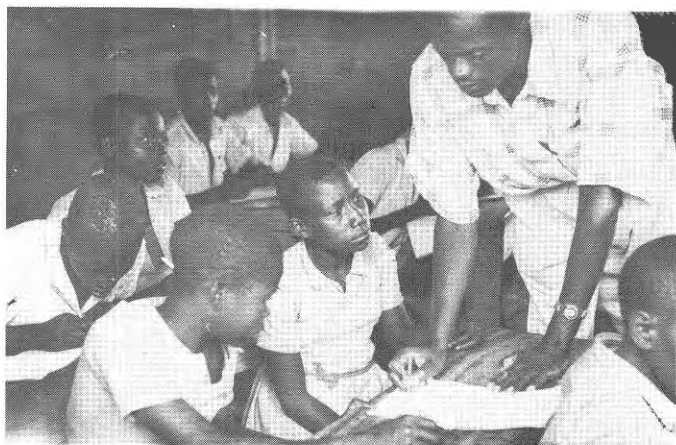
Teacher and students at Friends Primary School, Kaimosi

School at Kaimosi should be expanded to give training to youth workers and to leaders in work with women and in community development. Kaimosi Teacher Training College needs the backing of Friends' colleges in America to raise the entire program to junior college level. Training Christian workers and teachers is one of the most important services Friends in East Africa can render.