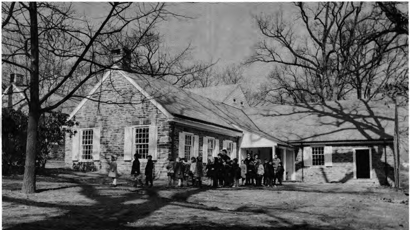
Addition to Abington Meeting and School, Jenkintown, Pa.