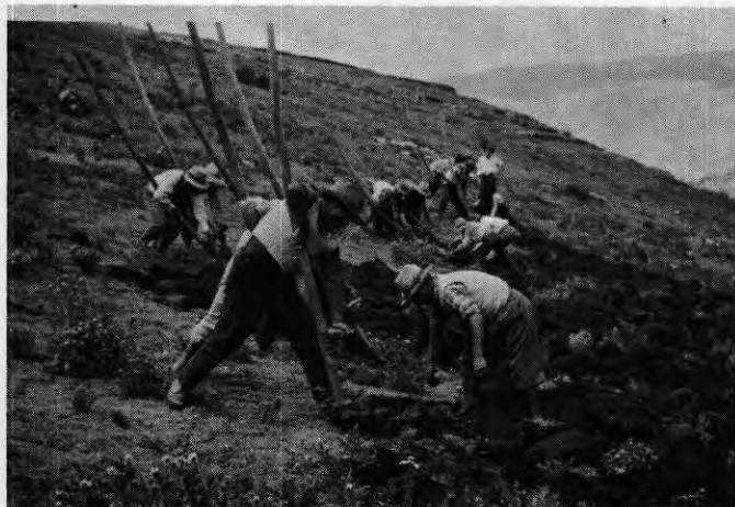
Indigenas breaking sod by hand and etching furrows with their chakitaklas

My journey takes me past erect eucalyptus trees with blue-green fingers fluttering in the gentle breeze. I gaze upward to ridges cutting into the heavens, their majestic cliffs topped by ruins of circular storehouses—a lasting reminder of the grandeur of the empire that once penetrated this land in the sky. My eyes fall to the trail where two beetles struggle to move a small ball of earth, rolling it forward and backward, making little progress. No living thing is comfortable in this land. Perhaps God has chosen it as His testing ground, for only those who work hard to sustain life may survive. Here one earns the privilege of life.