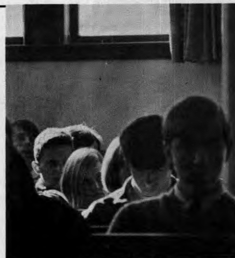
Oakwood Meeting for Worship