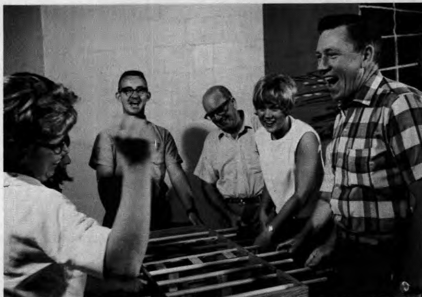
TABLE CRICKET GAME IS FUN FOR ADULTS OF ALL AGES !!!

The world's most widely used daily devotional guide 38 Languages—45 Editions 1908 Grand Ave. Nashville, Tenn. 37203