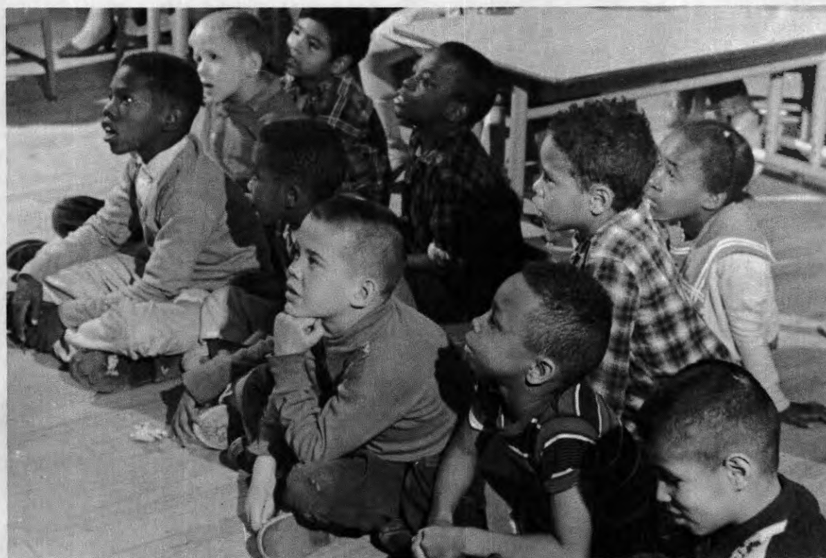
At a Green Circle program (See page 537)