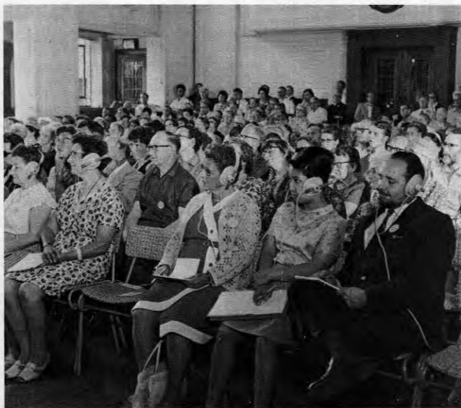
Delegates to the Third Conference of European Friends listen attentively; those in the front row listen, through earphones, to simultaneous translations of the proceedings.