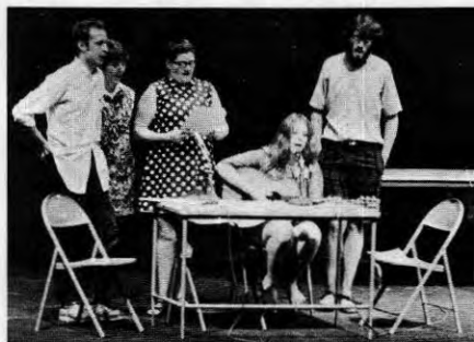
Young Friends at Wilmington

failed . . ." Later he sank to the floor as the other speakers before him, his head on his knees in the silence, as each of us in the audience thought: How can I be an instrument of God's peace?