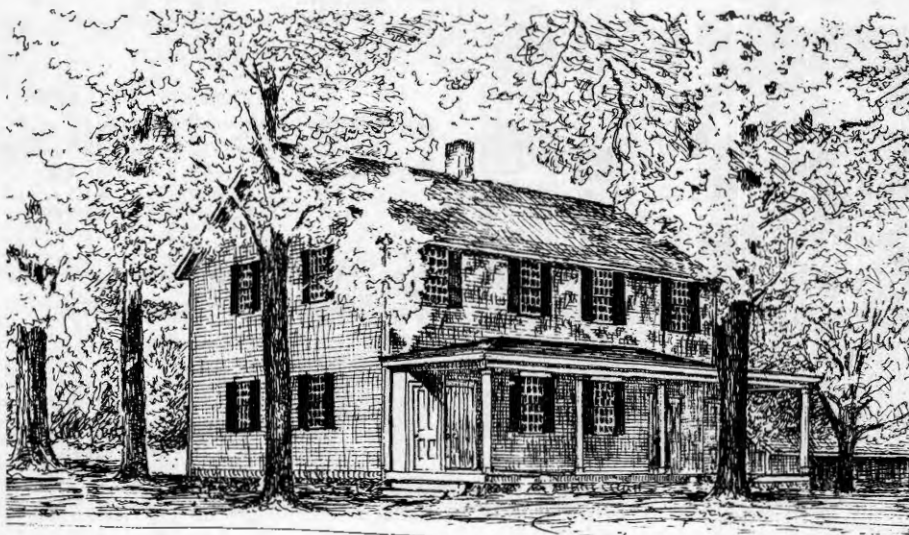
Cornwall Meetinghouse, New York