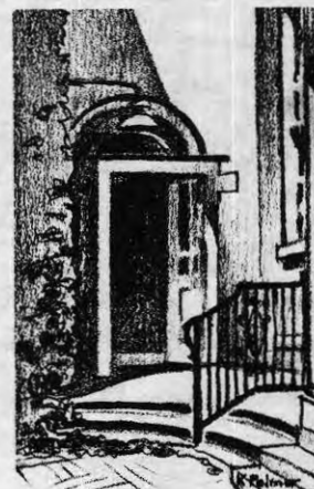
Friends Institute, Philadelphia

SHREWSBURY —First-day School, 10:30 a.m., meeting for worship, 11:00 a.m. (July, August, 10:00 a.m.) Route 35 and Sycamore. Phone 671-2651 or 431-0637.