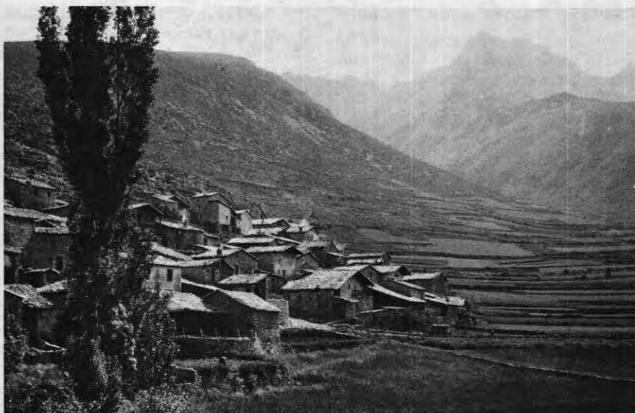
Partial View of Pedraforca

to see worshipers enter and kneel in front of us.