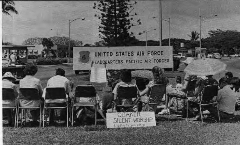
Palm Sunday Vigil, Hickam Air Force Base, Hawaii