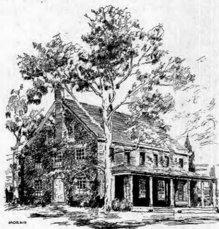
The Sandy Spring Friends Meeting House