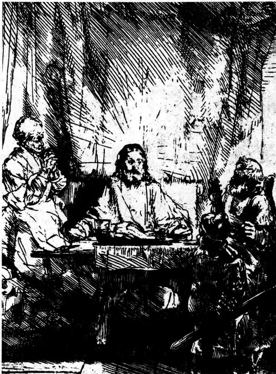
Rembrandt's Christ at Emmaus

The injunction to turn the other cheek is more problematic, because it does not suggest what to do if a