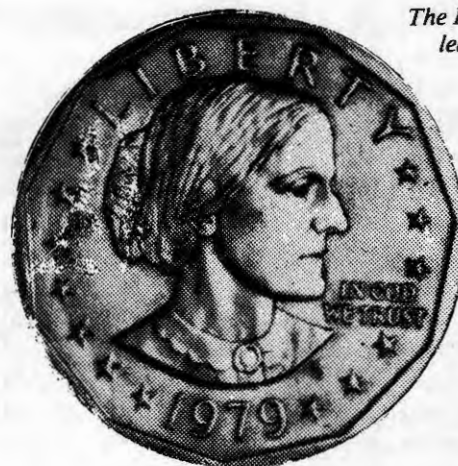
The 1979 U.S. Dollar released in February