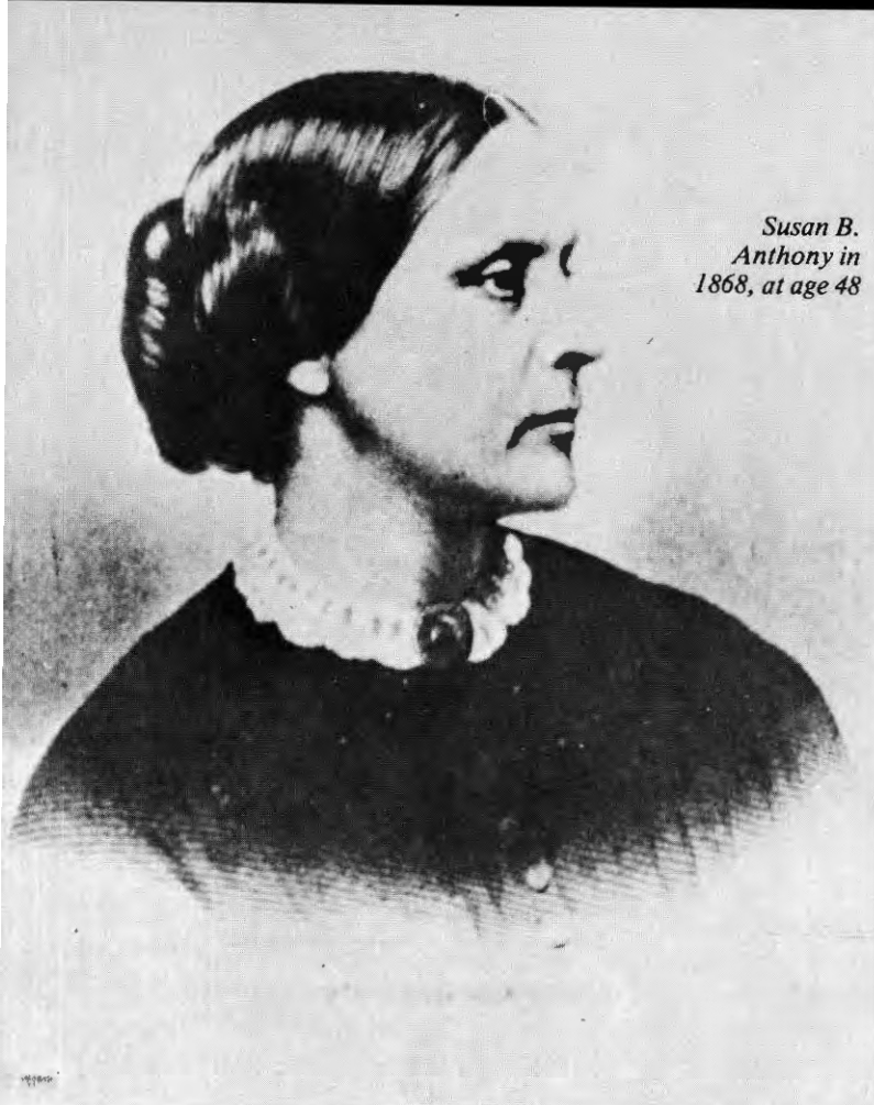
Susan B. Anthony in 1868, at age 48