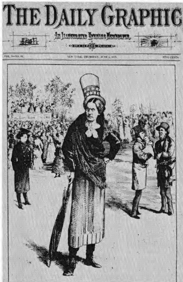
"The woman who dared"

With no home of their own, the family now moved a few miles down the Batten Kill to Hardscrabble, the raspish name of which Daniel helped change to Center Falls where he became the postmaster. Their home was an unoccupied tavern and Friend Anthony served travellers with food and nonintoxicating drinks at the bar. The tavern's attic posed a problem. It had been built as an assembly room and the Anthonys were soon approached by the neighborhood young people wanting to use it for dancing. Susan's mother approved. Daughter of a liberal Universalist father and Baptist mother, Lucy Read Anthony had enjoyed singing and dancing, pleasures which she gave up when she married Daniel and adopted the plain dress and other Quaker ways of living. Daniel refused the request of the young people, only to have them return to tell him their alternative was a tavern of ill repute where liquor was served. Weakening, Daniel took the matter under advisement with his wife and daughters, and finally said "yes," it being understood that the Anthony girls would not join the dancers. Every fortnight thereafter in came the fiddles and the young folks for reels and square sets, with Guelma, Susan and Hannah wallflowering the fun.